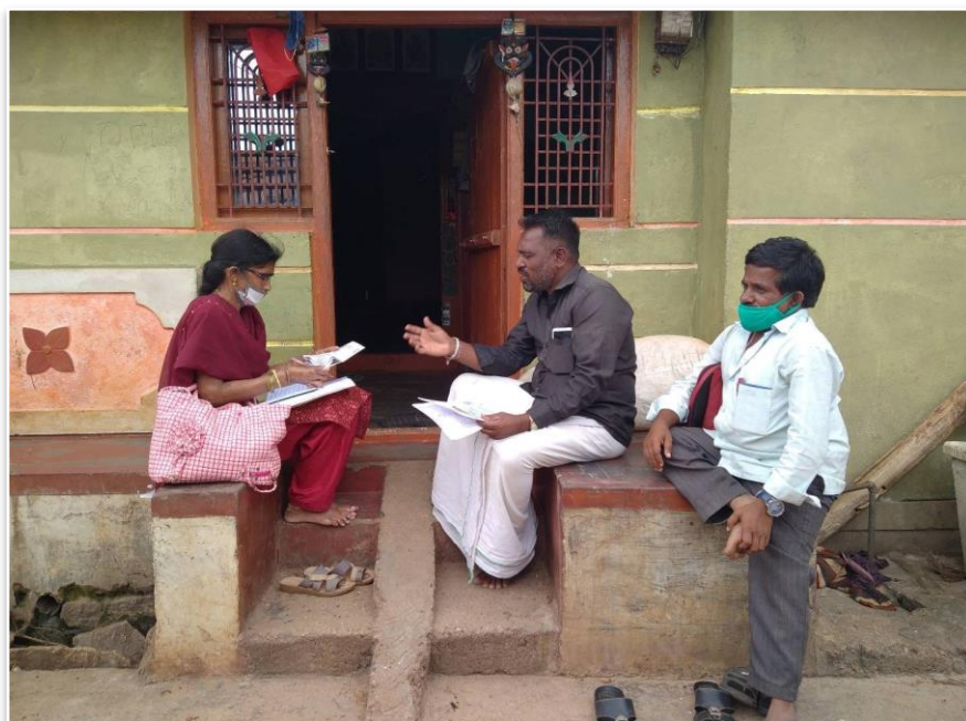
Baseline Survey, VAKS, Gundlupet