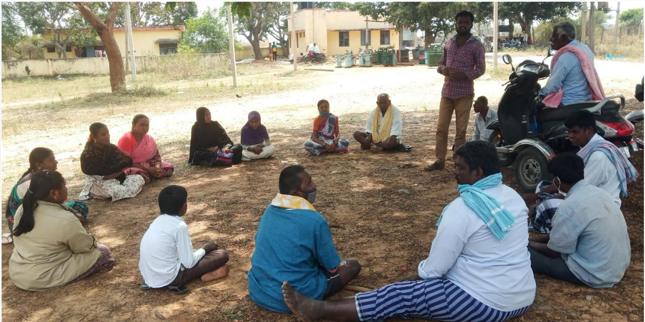
DPO Meeting, KVS, Chikkaballapur