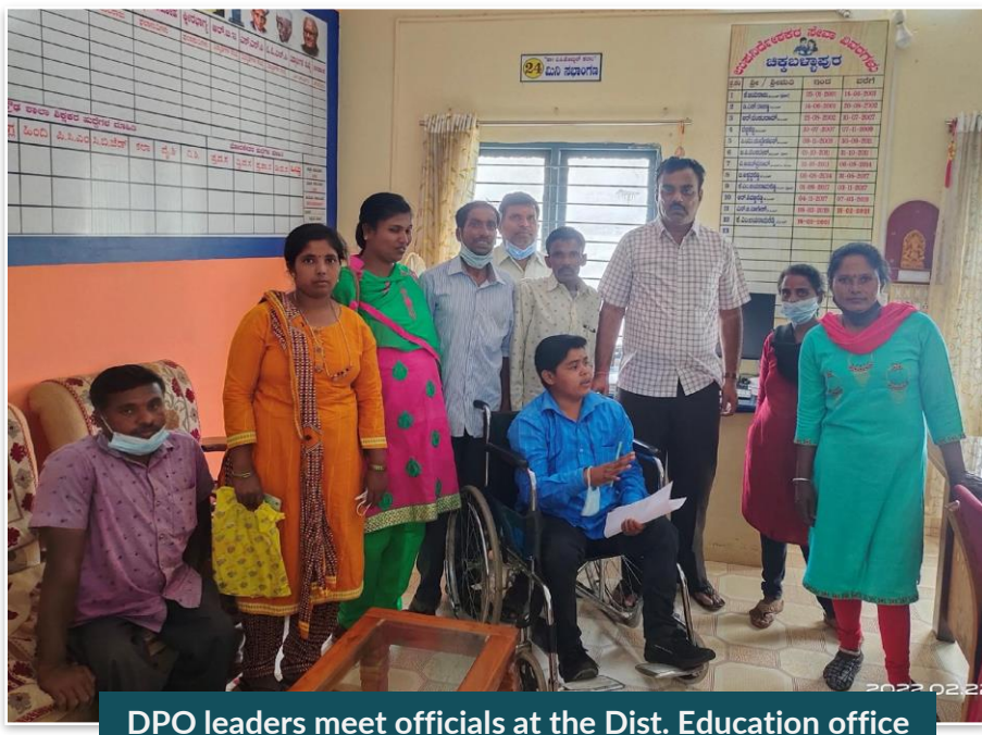
DPO leaders meet officials at the Dist. Education office