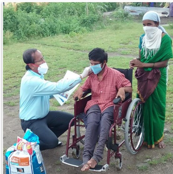
COVID-19 Essentials, MTCHT, Kalaburgi