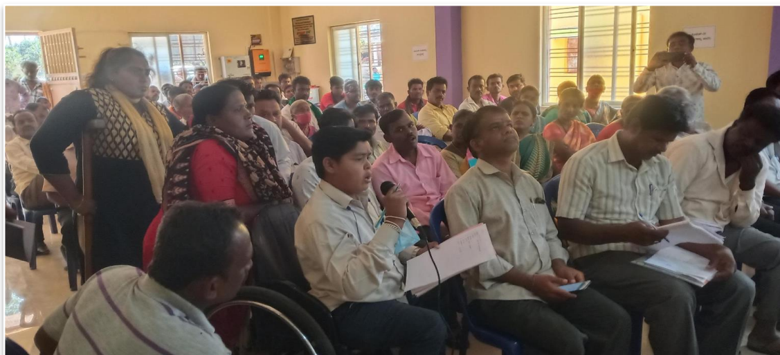
Making a request at the Gram Sabha, Chikkaballapur, Karnataka