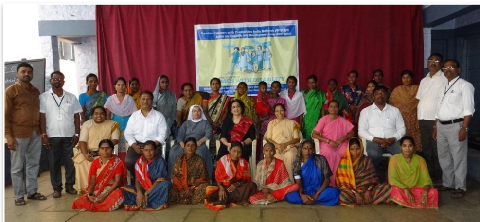
Workshop in collaboration with WWDIN