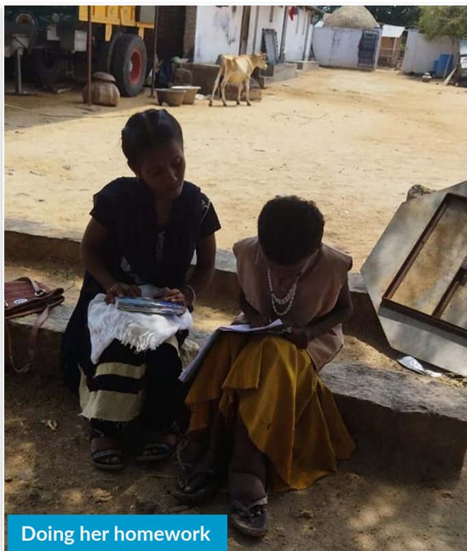
Doing her homework

With regular therapy along with follow up of the field staff at home Podumponnu is now able to do all her activities of daily living as well as attend school.