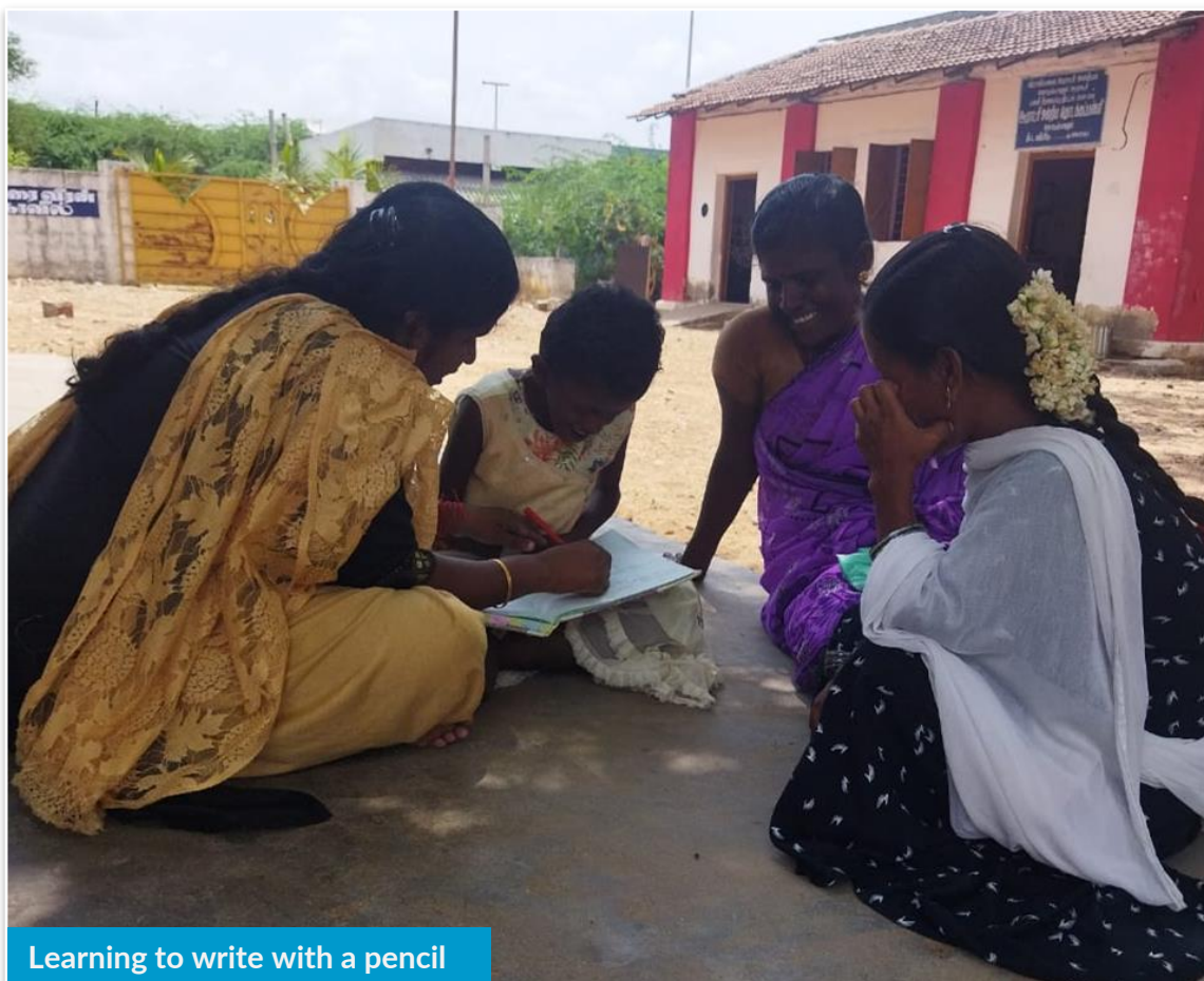
Learning to write with a pencil