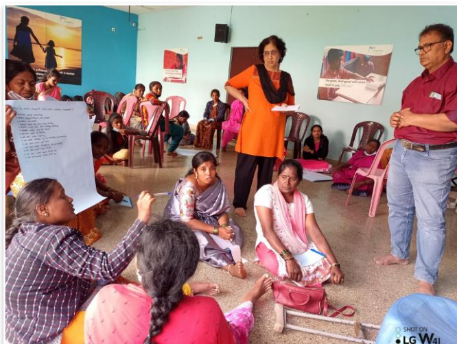
Women with disability at a workshop in Kalaburgi, Yelahanka