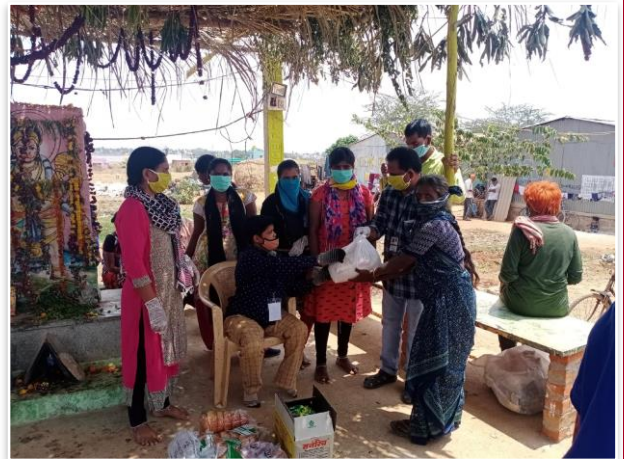
COVID-19 Awareness and distribution of essentials, KVS, Chikaballapur