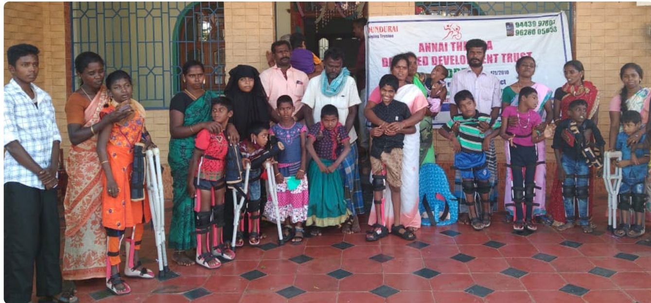
Children and their parents posing with their newly acquired customised aids, Pudukottai district, Tamil Nadu

A special thanks to all the resource persons and volunteers whose expertise helped us improve our work. We acknowledge the cooperation and support from the Persons with Disabilities, the DPOs and federations from the communities. Their cooperation during these difficult times is particularly appreciated. Without them and their contributions the very purpose of our existence is defeated.