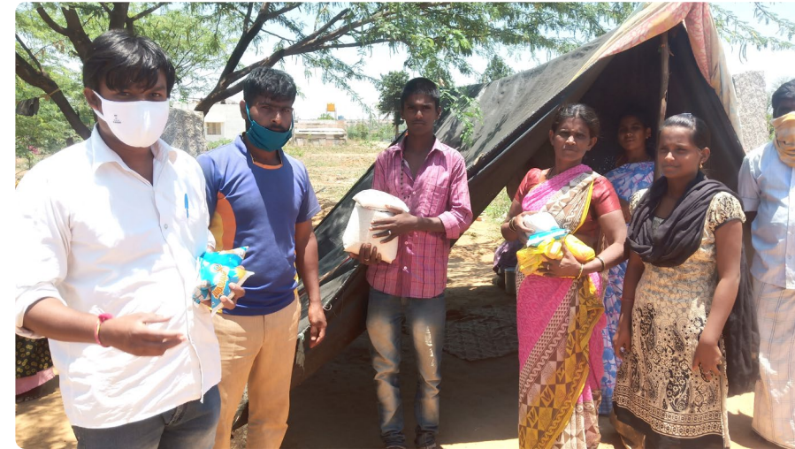
Left: Distribution of rations to migrant community, Chikkaballapur district, Karnataka