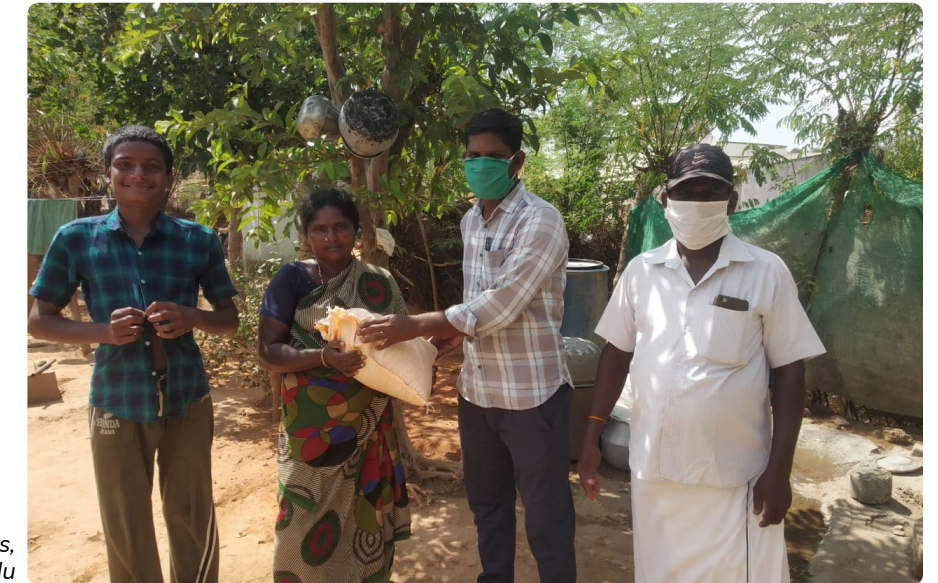
Right: Distribution of rations from local donors, Pudukottai district, Tamil Nadu