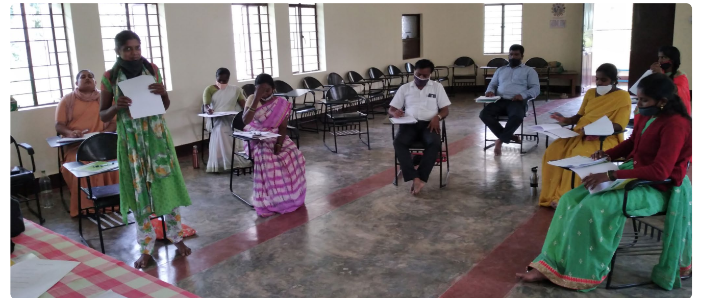
Training staff of partner organisations, Kolar district, Karnataka