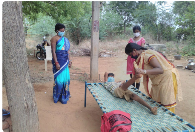
Top photo: Taking measurements to provide customised aids and appliances, Pudukottai district, Tamil Nadu Bottom photo: Providing physiotherapy through home visits and maintaining social distancing, Pudukottai district, Tamil Nadu