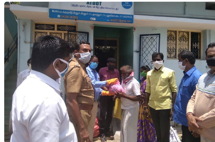
Left: Distribution of rations from local government departments, Pudukottai district, Tamil Nadu