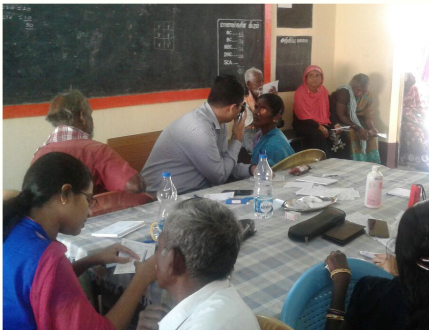
Eye camp at Viralimalai in collaboration with Arvind Eye Hospital

We have keenly pursued activities in three areas that offer us many opportunities for social engagement: (i) Awareness for prevention of disability; (ii) We organise eye camps; (iii) We have also started to celebrate World Disability Day on a grand scale. We are now agents of change. Reaching out to the larger population has not only improved our visibility but it has also amplified our voices in society.