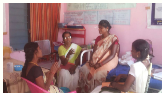
Awareness programme for pregnant women