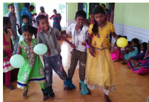
Summer camp in Keeranur, Tamil Nadu