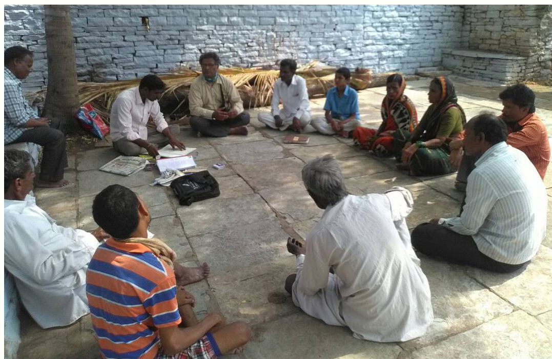
DPO training in Gulbarga