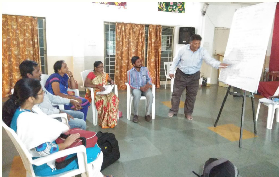
Staff training in progress at partner organisation Seva Sangama

The partner organisations in Kalaburgi reach out to about 4000 persons with disabilities through their CBR workers. The emphasis on the training given to the CBR workers here is on facilitation of DPO meetings and building leadership in the DPOs. Initially the focus of these DPO meetings is members' access to their entitlements such as ID cards and bus pass for local travel. As these basic needs are fulfilled, DPOs begin to discuss the rehabilitation needs of their members.