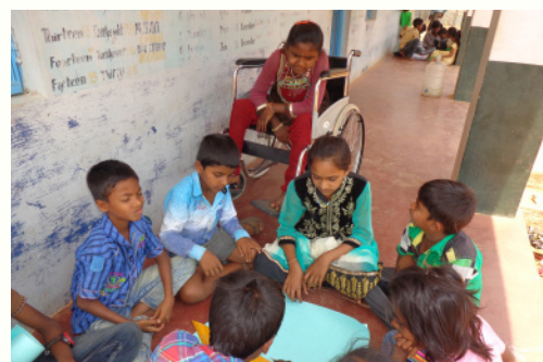
Summer camp in Siddlaghatta, Karnataka