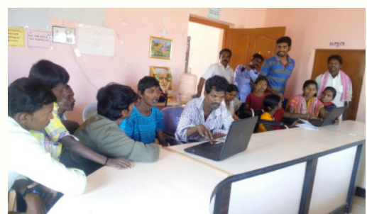
DLM Training at Sadali, Karnataka

Spanning 20 hours, the training offered at the Digital Learning Mission (DLM) centre places emphasis on teaching people to leverage the Internet to seek information and avail online services.