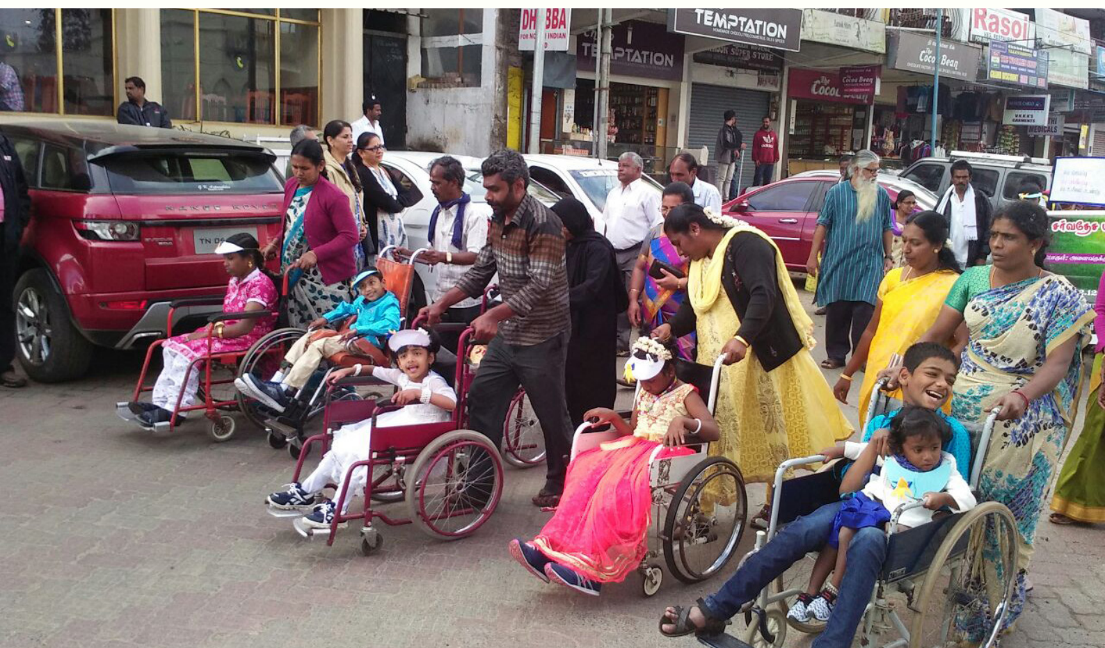
World Disability Day organised in Kodaikanal

ADD India has supported the capacity building programs of CSI Rehabilitation Centre, Kodaikanal, Tamil Nadu which runs a full-fledged community based programme in the villages of Kodaikanal. ADD India trained the members of the DPOs to form a federation, a parent's association for children with disabilities and a group of women with disabilities. The training encouraged the federation to take up the responsibility of organising an event for World Disability Day entirely by themselves.