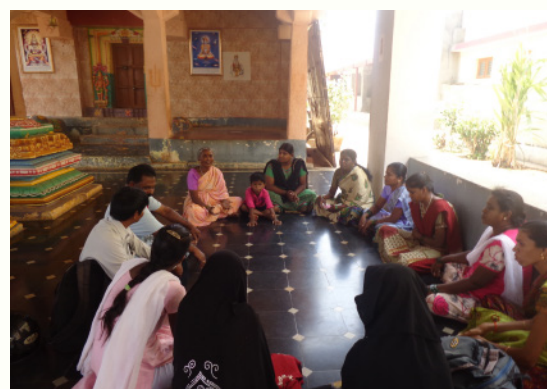
Mahila meeting at Siddlaghatta

In order to offer women with disabilities a platform to share their experiences and build their potential, ADD India has been organizing a series of Mahila meetings in Tamil Nadu and Karnataka. In addition to financial literacy and the effective utilization of disability schemes, the meetings in Siddlaghatta, Karnataka also elucidated on topics, such as seeking treatment for mental health problems.